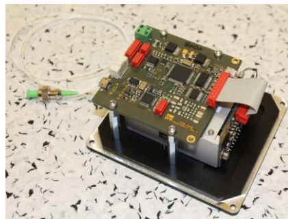
I-MON OEM Developer's Kit

The spectrum graph screen of the Evaluation Software illustrates the pixel response from the image sensor of the I-MON 256/512 OEM, i. e., the FBG sensor peaks.